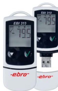
EBI 310 High precision version