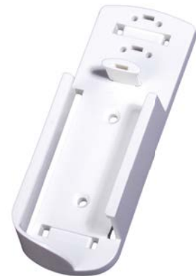
EBI 300-WM Wall Mount for EBI 300/310