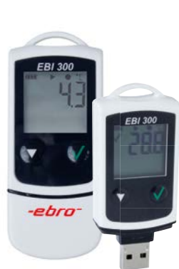
EBI 300 Standard version